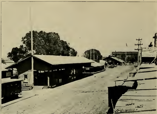
FIRST DEPOT OF THE SACRAMENTO VALLEY RAILROAD, BUILT IN 1862